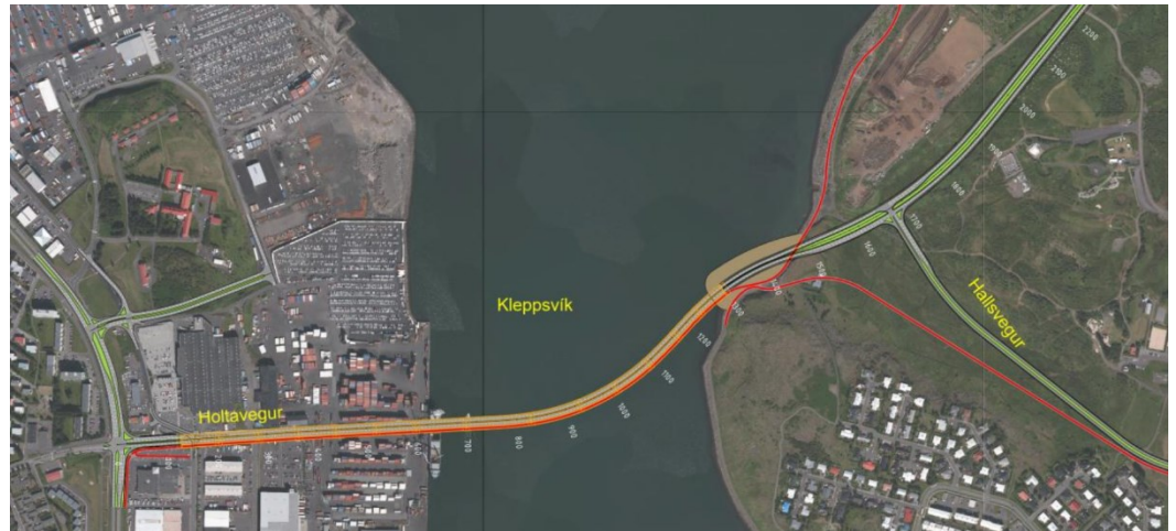
Figure 3-3 Phase 1 with bridge and level intersections in Lauganes and Gufunes

Phase 1 with tunnel has two connections south of Kleppsvík to Sæbraut, one to the south between Holtavegur and Kleppsmýrarvegur, and one to the west by Dalbraut. In Gufunes where it connects to phase 2 it has only one intersection, with Borgarvegur, and it will be a grade separated intersection. The tunnel lies too deep for a connection to Hallsvegur to be possible.