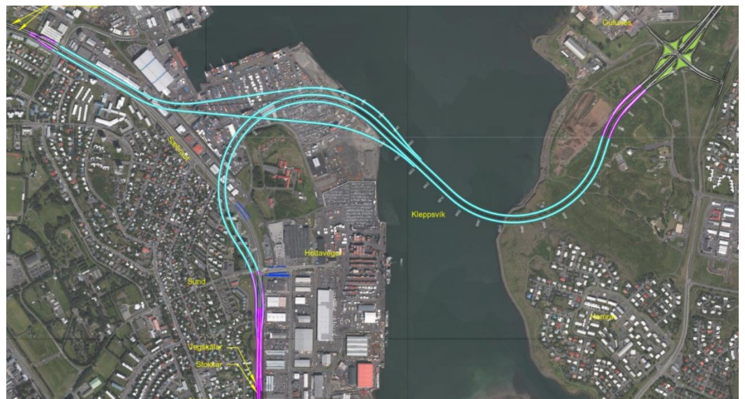
Figure 3-4 Phase 1 with tunnel with connection to both north and south and with grade separated intersection in Gufunes

Phase 2 lies from Gufunes to Kjalarnes. It is about 8 km long and includes 4 bridges and 5-6 intersections.