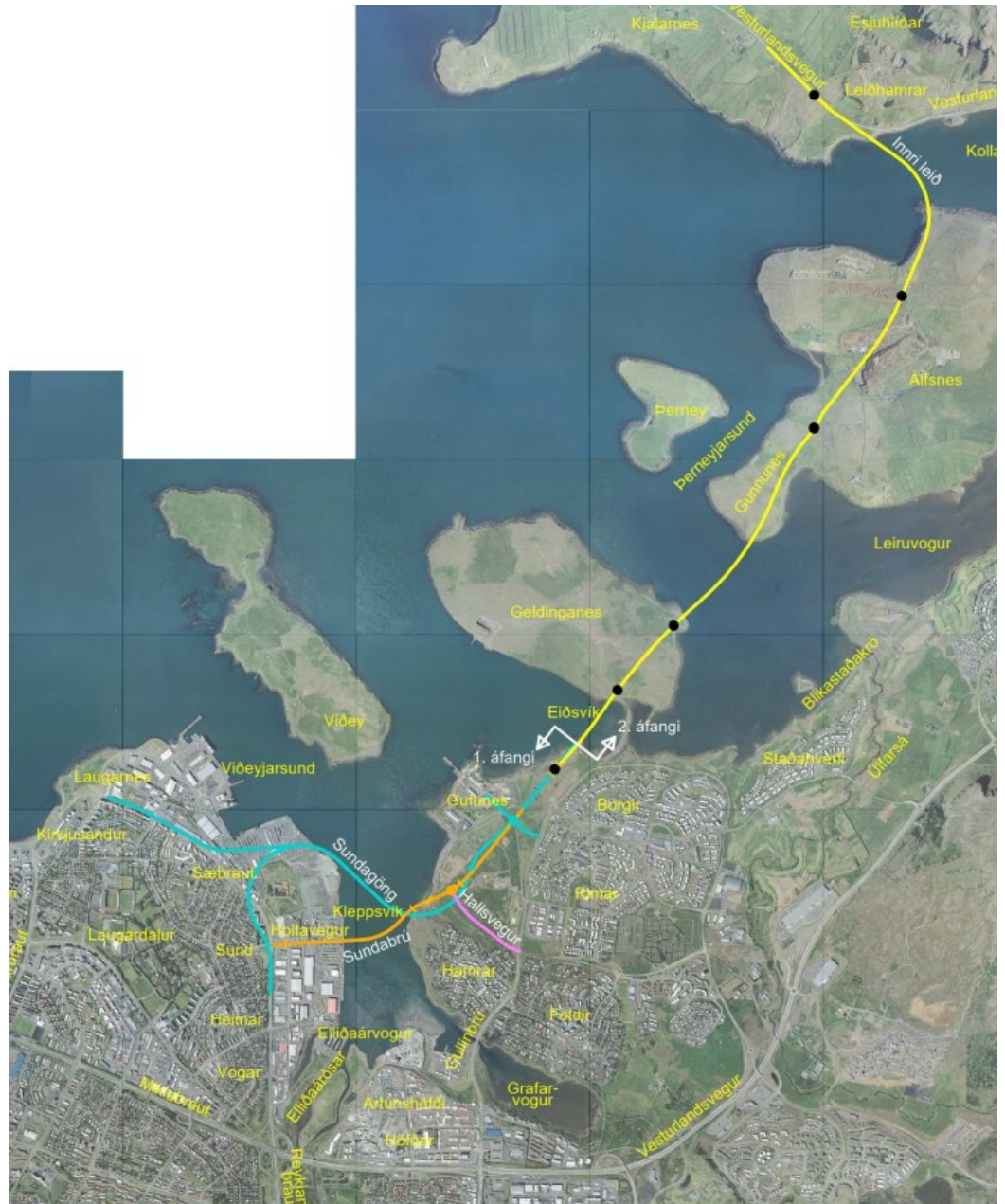
Figure 3-2 Overview of the Sundabraut project. Phase 1 with bridge in orange, phase 1 with tunnel in blue and phase 2 with yellow

Phase 1 with bridge has an intersection in the south end to Hóltsvegur, and north of the bridge, in Gufunes, it has two intersections, with Hallsvegur and with Borgarvegur. These three intersections can all be either level intersections (with traffic lights or roundabouts) or grade separated intersections, and have all been cost estimated as both options.