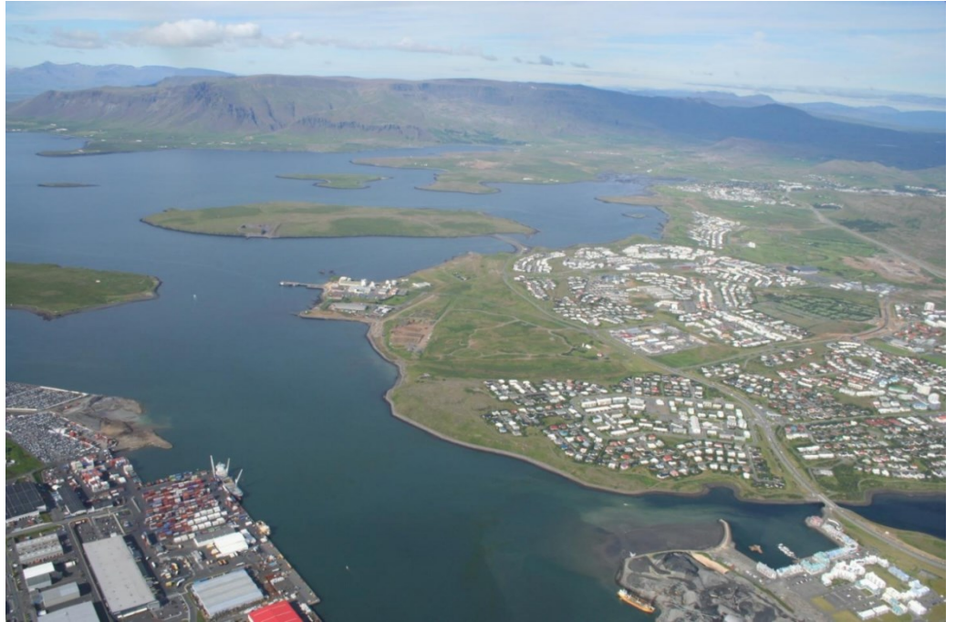
Figure 3-1 Aerial photo of the area where Sundabraut will be located

The Sundabraut project is split into two phases. Phase 1 is the crossing over the port area and the Kleppsvík bay, over to Gufunes in the Grafarvogur neighbourhood. Phase 2 continues from Grafarvogur and north to Kjalarnes where it connects to the Vesturlandsvegur highway. For phase 1 there are two options being evaluated, a bridge and a tunnel. For phase 2 only one option is evaluated.